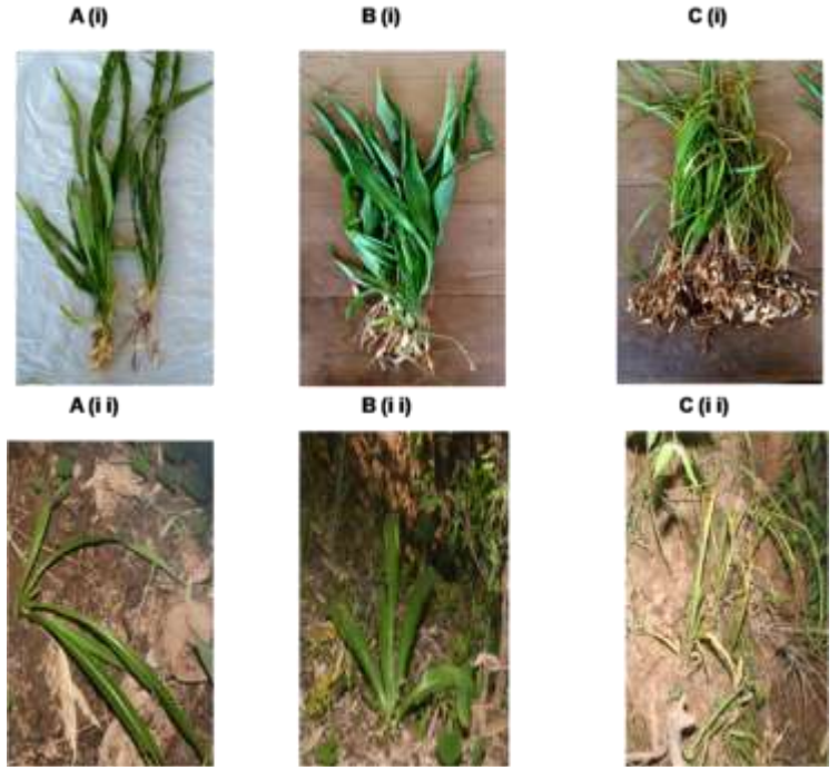
Figure 1 - Chlorophytum borivilianum plants collected from different districts of Vindhya region of Madhya Pradesh in their Natural habitats; A (i) Plant after collection from Ateraila forest of Rewa district and (ii) Plant in Natural habitat; B (i) Plant after collection from Chitrakoot forest of Satna district and (ii) Plant in Natural habitat; C (i) Plant after collection from Churhat forest of Shidhi district and (ii) Plant in Natural habitat.

Maximum number of shoots were reported from Churhat forest of Shidhi District whereas Chitrakoot forest of Satna and Ateraila forest of Rewa District have similar number of shoot per plants.(Figure1). Plants shoots from each region differ in their shape and size. The shoot width is more in Chitrakoot plant followed by Ateraila and Churhat Plants respectively whereas shoot length is more in Churhat plant and followed by Ateraila and Chitrakoot plants respectively. It was also observed the number of tubers per plant also differ in different localities. Churhat plants have maximum no. of tubers in comparison to Chitrakoot and Ateraila plants.